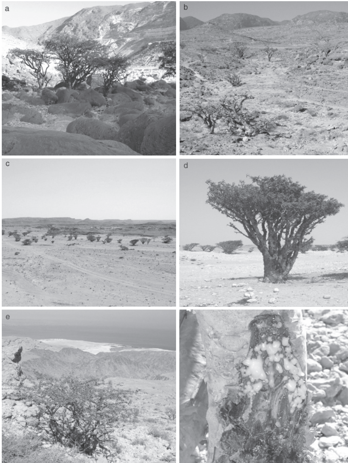
Figure 1 – Frankincense areas in Dhofar: a) al Mughsayl; b) wadi Adonib; c) wadi Doka; d) An old tree of Boswellia sacra at wadi Doka; e) Hasik mountains; f) Hasik: frankincense oozing from the bark of a Boswellia sacra tree.